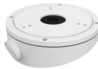
DS-1281ZJ-M Inclined Ceiling Mount