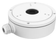
DS-1280ZJ-M Junction Box