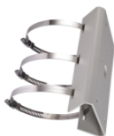
DS-1275ZJ Vertical pole mount