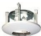
DS-1227ZJ In-ceiling mount