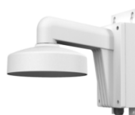
DS-1273ZJ-135B Wall mount with Junction box