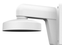
DS-1273ZJ-135 Wall mount