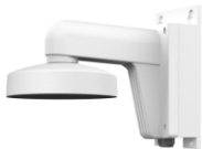
DS-1273ZJ-130B Wall Mount with junction box