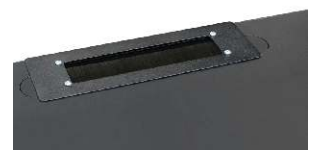
The RAPS-A brush strip panel