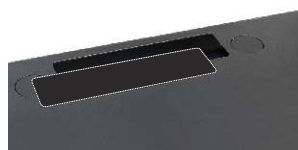
Knocked-out opening for cable