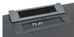
Brush grommet RAPS-A