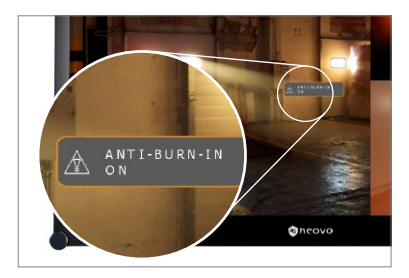
Anti-Burn-in ^{\scriptscriptstyle{15}} technology prevents image sticking

Multiple video inputs (HDMI, DVI, VGA, CVBS, S-Video) make possible effortless system integration