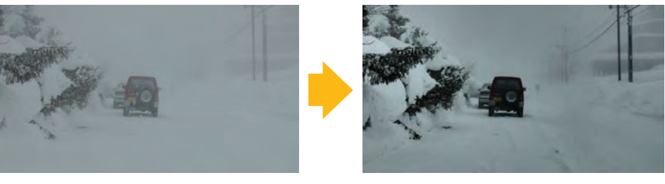
Spatial Tonal Correction, Snowfall and Rainfall Noise Reduction